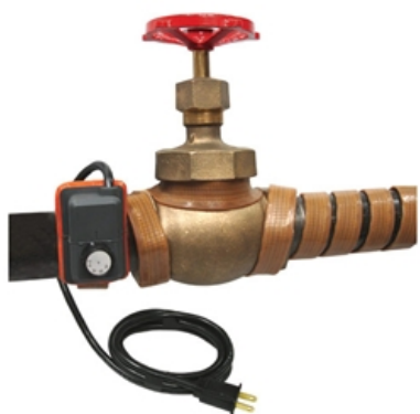
Extruded Silicone Rubber Tapes